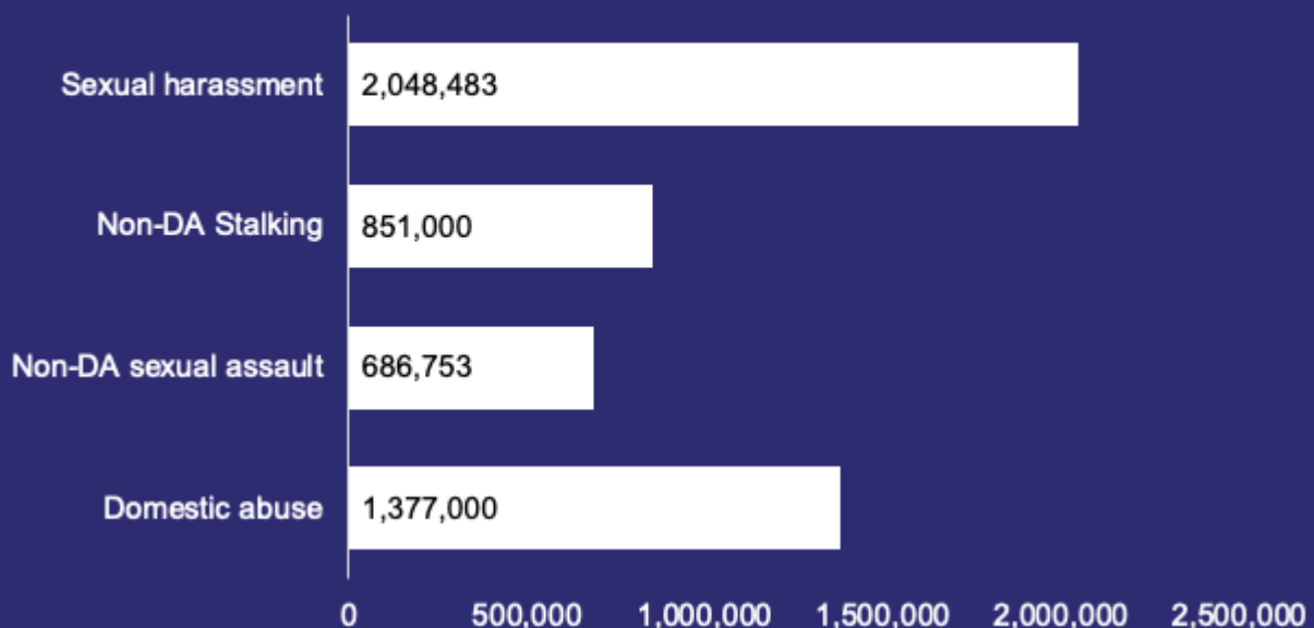
Estimated number of female victims aged 16 and over of different VAWG offence types, year ending March 2023, CSEW

This is a lower-bound estimate of female VAWG victims based on sexual harassment data from the Crime Survey for England and Wales (CSEW). 34 There are a substantial number of victims of other offence types who will not be counted within our 1 in 12 figure. VAWG is not a single type of crime, but a collection of offences including Domestic Abuse (DA), sexual assault, stalking and harassment. The 2 million women who experience sexual harassment 35 each year will include some, but not all, of the 1.4 million women who experience DA 36 , the 700,000 women who experience non-DA sexual assault 37 or the 850,000 women who are subjected to non-DA related stalking. 38 A result of VAWG not being a single type of crime means this report relies on different datasets which use different time periods.