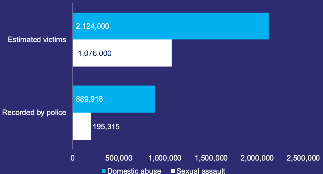
Estimated victims versus police recorded crime

In isolation we cannot offer the sole solution. To complement our NFD we ask for a government-led long term whole system response that is mandated through effective legislation, robust performance management and joint inspection, congruent to the level of demand.